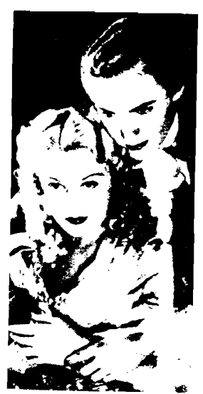
Madeleine Carroll and Tyrone Power from a scene in Lloyds of London.