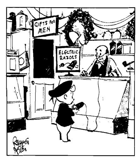
"This gift will break me, but it'll get rid of that razor strop for good."

visitors. Two crooks were mutually agreed on the proposition that crime, when properly framed, could pay in plenty.